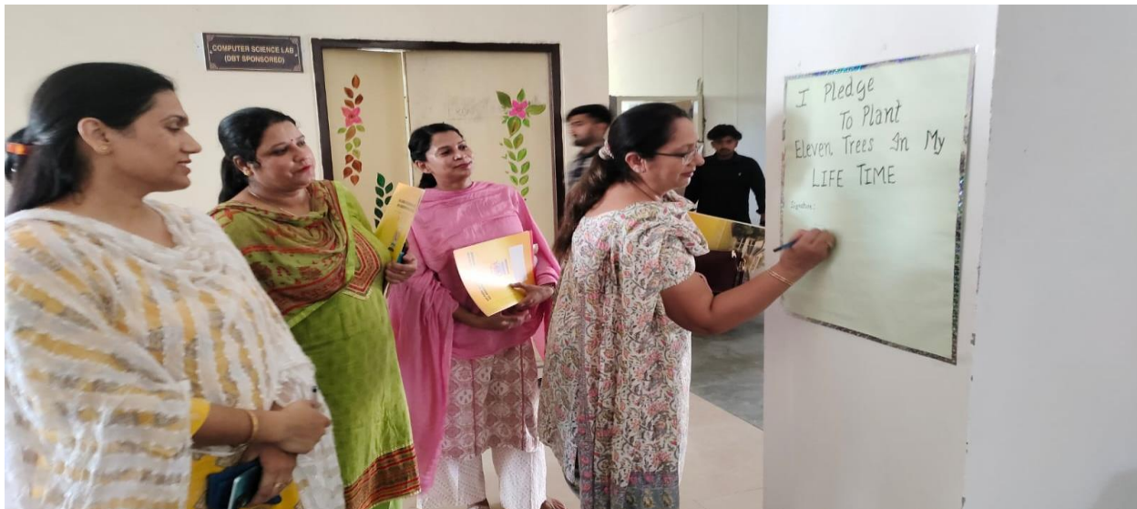
Glimpses from Leaf Art Competition and Tree Plantation Drive