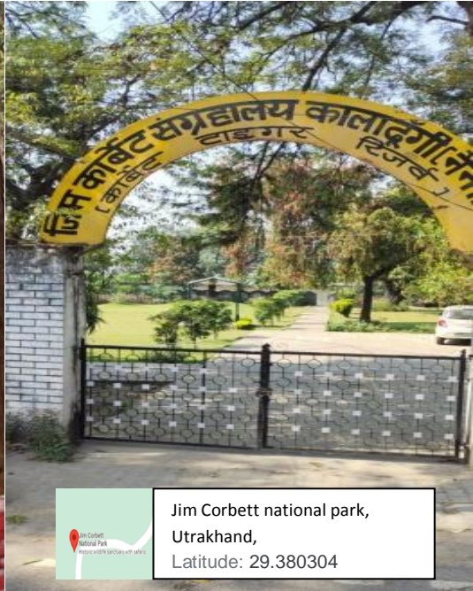
Jim Corbett national park, Utrakhand, Latitude: 29.380304